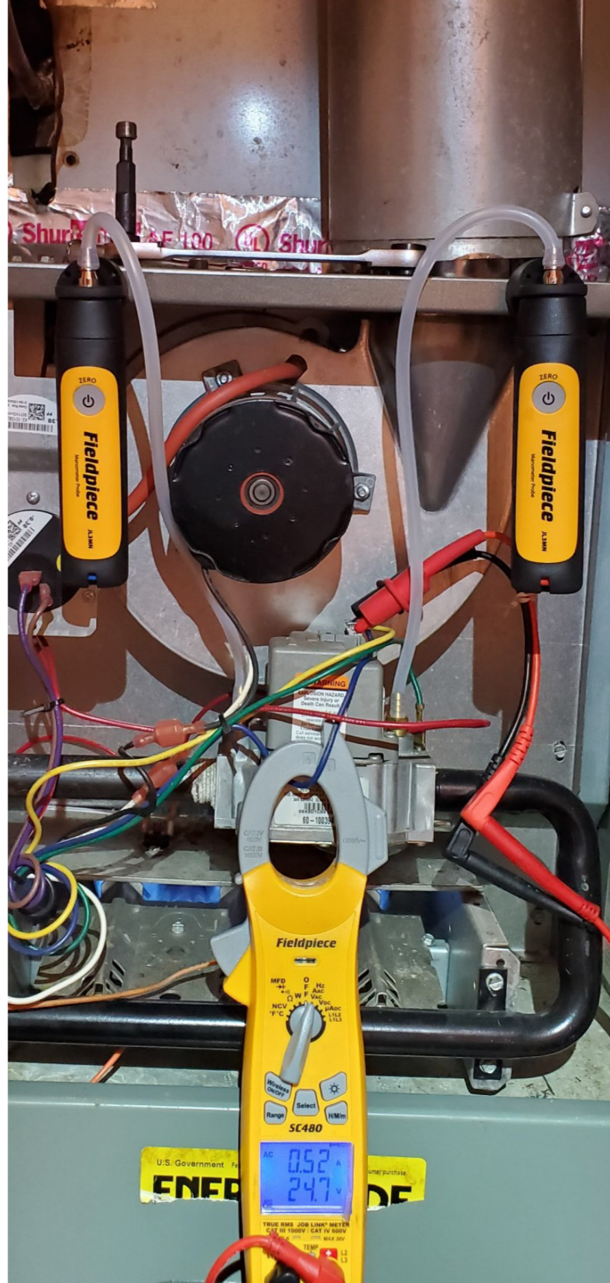
JL3MN - Job Link Manometers SC480 - Wireless Power Clamp Meter