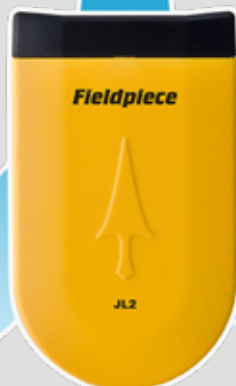
Wireless Transmitter model JL2