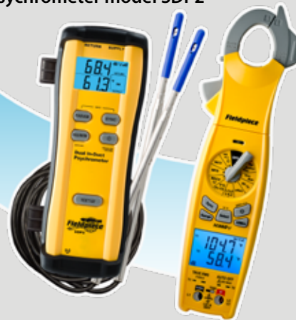
Wireless Clamp Meter model SC660