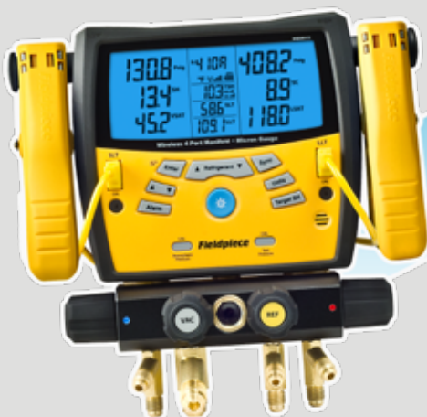
Wireless Digital Manifolds models SMAN4, SMAN440, SMAN460